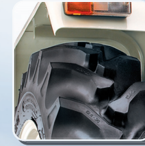
345.40 X 711.20 (13.60 X 28) REAR TYRE