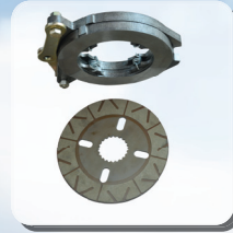
MULTI DISK OIL IMMERSED BRAKES