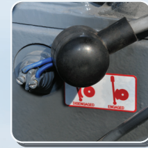
NEUTRAL SAFETY SWITCH