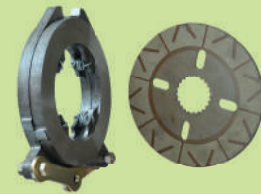
Oil Immersed Brakes